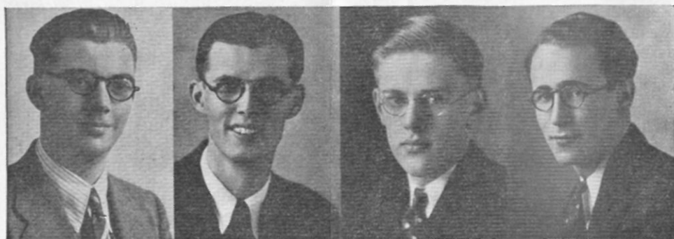
The Debate Team

Phi Alpha is the honorary scholastic organization of the college.