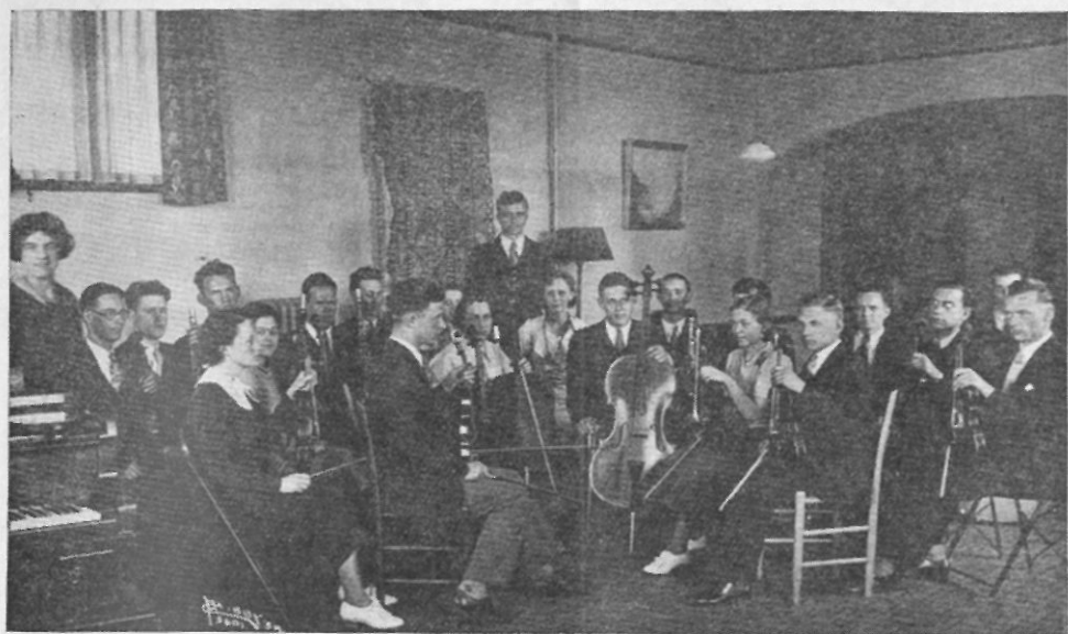
Whitworth College Orchestra 1933-34