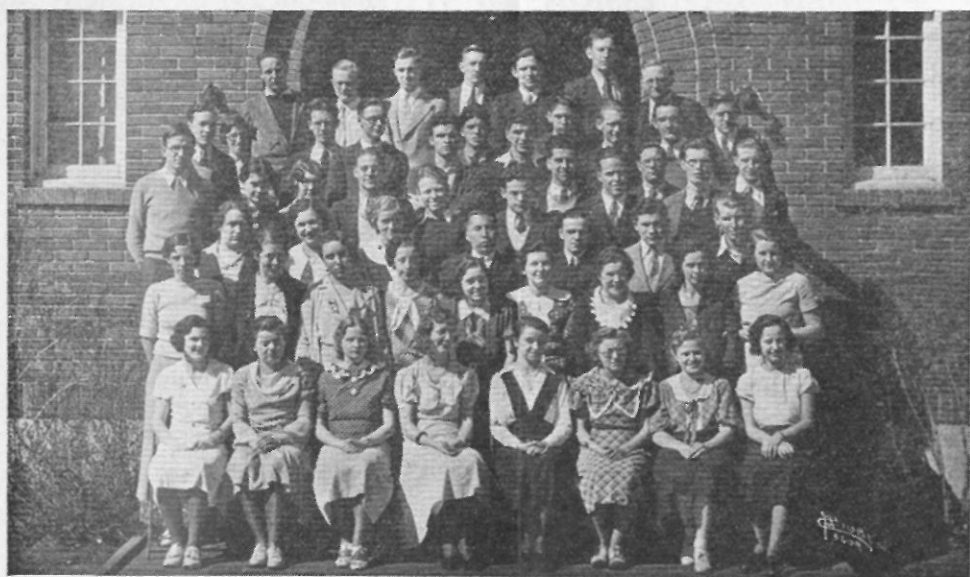
Volunteer Fellowship Group

Whitworth College is located two and one-half miles north of the city limits of Spokane. It is fully accredited and is well equipped to meet all the needs in the field of liberal arts and sciences. It is also able to give courses leading to engineering, law, medicine, nursing or practically any other profession or business. It is equipped with strong departments in music and dramatics. Its teaching staff is composed of twenty-two men and women who have been trained in the best graduate schools of the country. Whitworth College is able to give personal attention to each student as there is one teacher for not more than fifteen students.