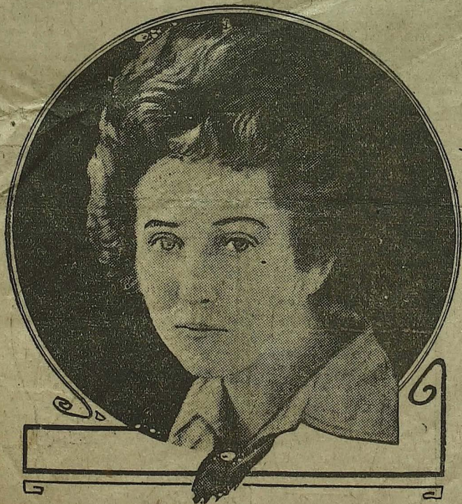
MRS. J. B. DODD.

Say, dad, here's a very clever lady you really ought to know. She is Mrs. John Bruce Dodd, of Spokane, Wash. Mrs. Dodd recently won national fame and praise by founding a "Father's Day," similar in idea to "Mother's