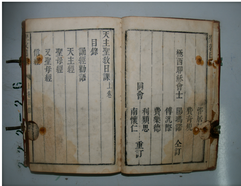
2011: Former Lazarist Library, sample of the second floor rare Chinese books (Tianjin, China).