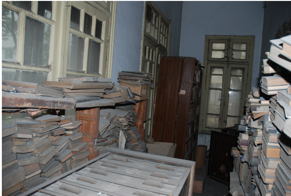
2011: Former Lazarist Library, condition of the first floor (Tianjin, China).