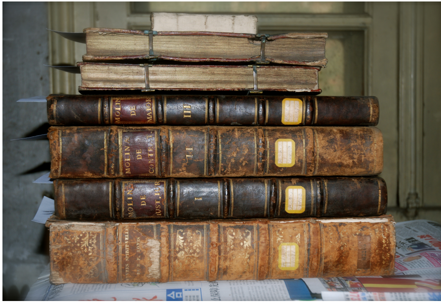
2011: Former Lazarist Library, sample of the second floor rare Western books (Tianjin, China).