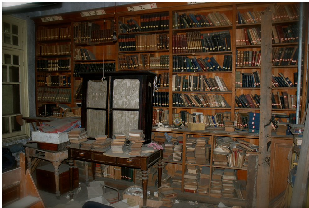
2011: Former Lazarist Library, second floor bookshelves (Tianjin, China).