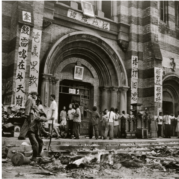
1966: Red Guard destruction of church and library materials (Tianjin, China).